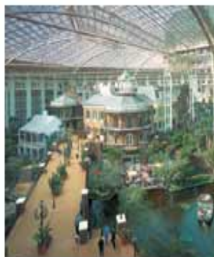
Gaylord Nashville Nashville, Tennessee